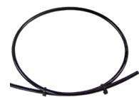
EH-LHDC-105°C-2 Linear Heat Detection Cable 105 °C, 2 pole TKZ: 50460