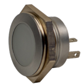
EH-SMFE22214 Duo-LED - two-tone (red / green) TKZ: 21105